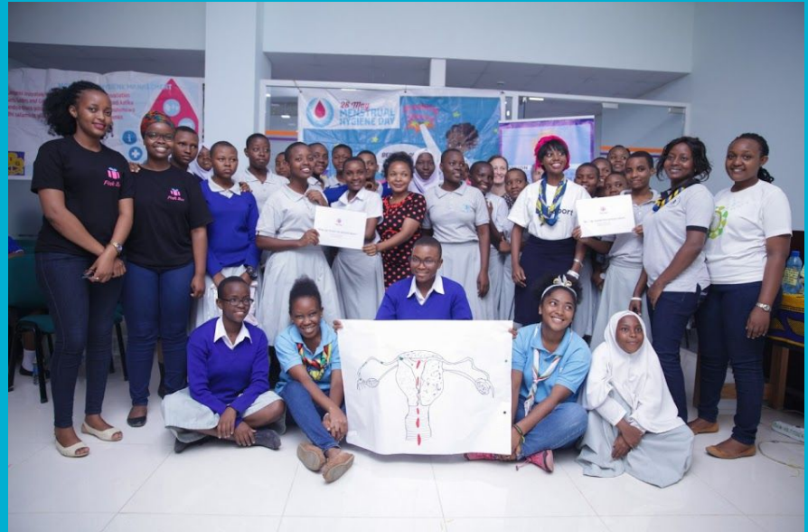
Tanzania Girl Scouts Association