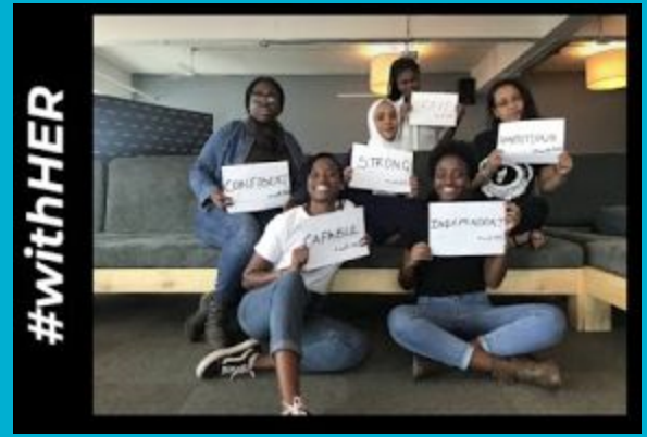
African Leadership University International Day of the Girl Child