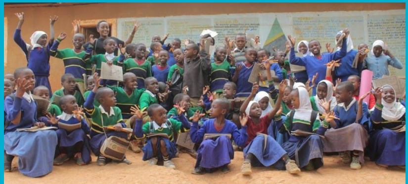
Fumboa Ng'ombe Primary School